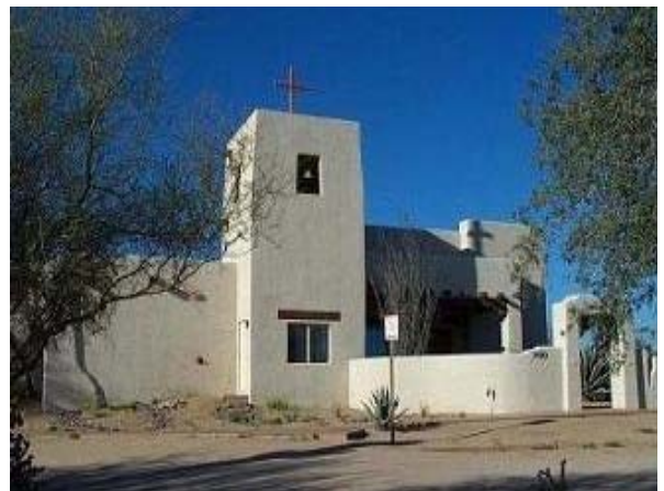
Redeemer Lutheran Church

Our mission is to preach the Word of God, both Law and Gospel, faithfully in accordance with the Holy Scriptures and the Confessions of the Evangelical Lutheran Church; correctly to administer the Holy Sacraments for the forgiveness of sins; and to reach out to those who have not yet come to faith in Christ Jesus.