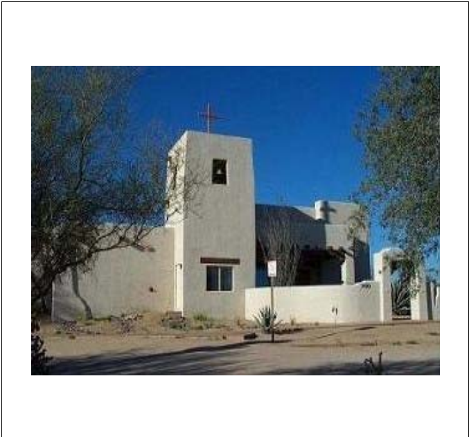
Redeemer Lutheran Church

Our mission is to preach the Word of God, both Law and Gospel, faithfully in accordance with the Holy Scriptures and the Confessions of the Evangelical Lu- theran Church; cor- rectly to administer the Holy Sacraments for the forgiveness of sins; and to reach out to those who have not yet come to faith in Christ Jesus.