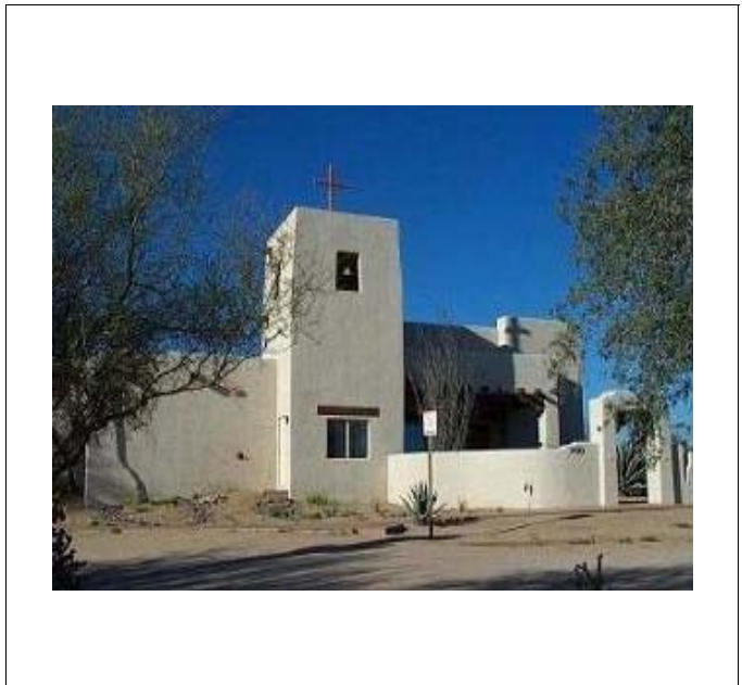
Redeemer Lutheran Church

Our mission is to preach the Word of God, both Law and Gospel, faithfully in accordance with the Holy Scriptures and the Confessions of the Evangelical Lu- theran Church; cor- rectly to administer the Holy Sacraments for the forgiveness of sins; and to reach out to those who have not yet come to faith in Christ Jesus.