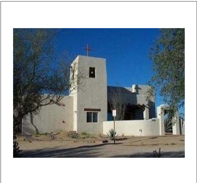
Redeemer Lutheran Church

Our mission is to preach the Word of God, both Law and Gospel, faithfully in accordance with the Holy Scriptures and the Confessions of the Evangelical Lutheran Church; correctly to administer the Holy Sacraments for the forgiveness of sins; and to reach out to those who have not yet come to faith in Christ Jesus.