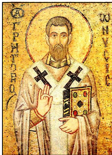
St. Gregory of Nyssa

Christ...was born as it were a few days ago – he whose generation was before all things... Today He is baptized by John, that he might cleanse him [fallen man] who was defiled; that he might bring the Spirit from above, and exalt man to heaven; that he who had fallen might be raised up, and he [the devil] who had cast him down might be put to shame. And marvel not if God showed such great earnestness in our cause: for it was with care on the part of him [the devil] who did us wrong, that the plot was laid against us; [so too] it is with forethought on the part of our Maker that