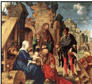
Albrecht Durer The Adoration of the Magi

Can we do anything about it? No, we cannot – except to ignore it as much as we can. But one way to respond to the secular society's distorted understanding of Christmas could be deliberately to celebrate Christmas – and the Christmas season – according to the Christian church year, and not according to the secular marketing year. Worldlings think that Christmas is over on December 25. But we've got a secret that we're not going to let them in on: The real Christmas is actually just beginning on that day! So, as Christians, we can continue our celebration of the Savior's birth – without the distractions of commercialism – for eleven more unencumbered days of spiritual and religious rejoicing.