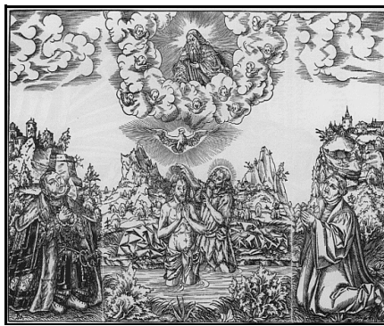
The Baptism of Christ