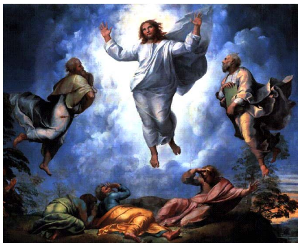
Raphael: The Transfiguration of Christ