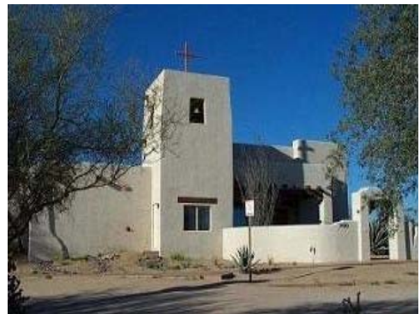
Redeemer Lutheran Church

Our mission is to preach the Word of God, both Law and Gospel, faithfully in accordance with the Holy Scriptures and the Confessions of the Evangelical Lu- theran Church; cor- rectly to administer the Holy Sacraments for the forgiveness of sins; and to reach out to those who have not yet come to faith in Christ Jesus.